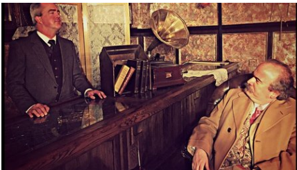
Milwaukee Entertainment Group Unmasks 'The Secret of Sherlock Holmes'