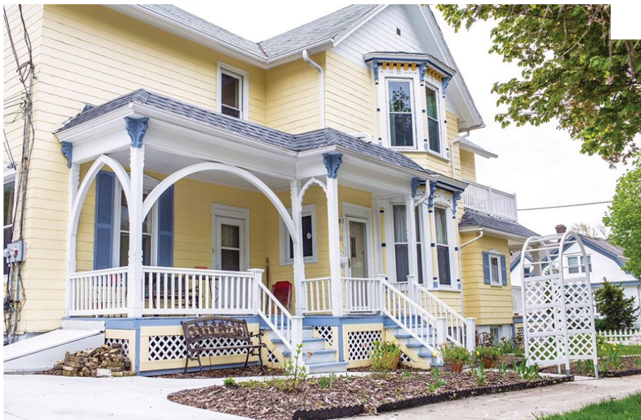
The Muse Gallery Guesthouse