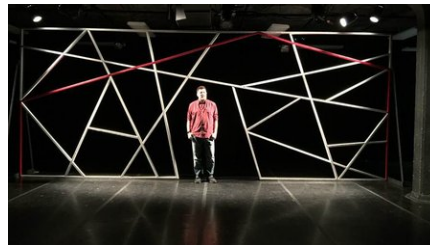
Theater Preview: Jan. 25-31, 2018