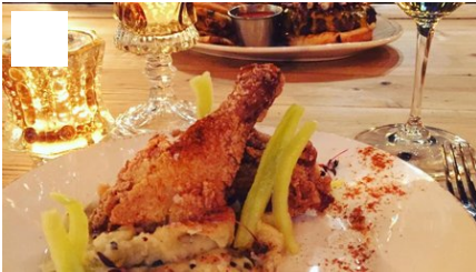
Dining and Gathering at Bay View's Kindred